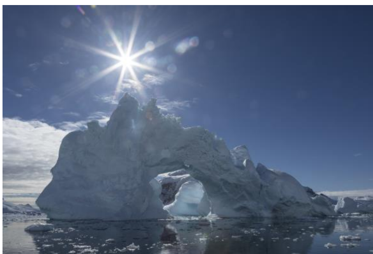
Ice sculpture, Neko Harbor, Antarctica .