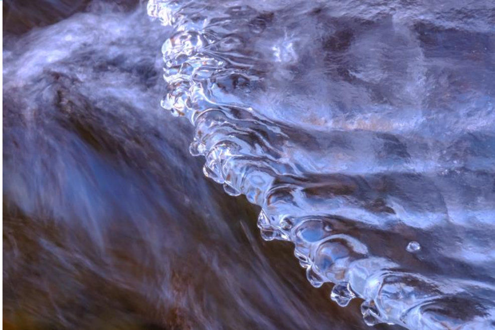
I loved the juxtaposition of the smooth frozen drops on the edge of the ice sheet against the rushing water below. McHugh Creek, Fujifilm X-T2 with 100-400 lens at 252 1/8 at f/18 ISO 800.