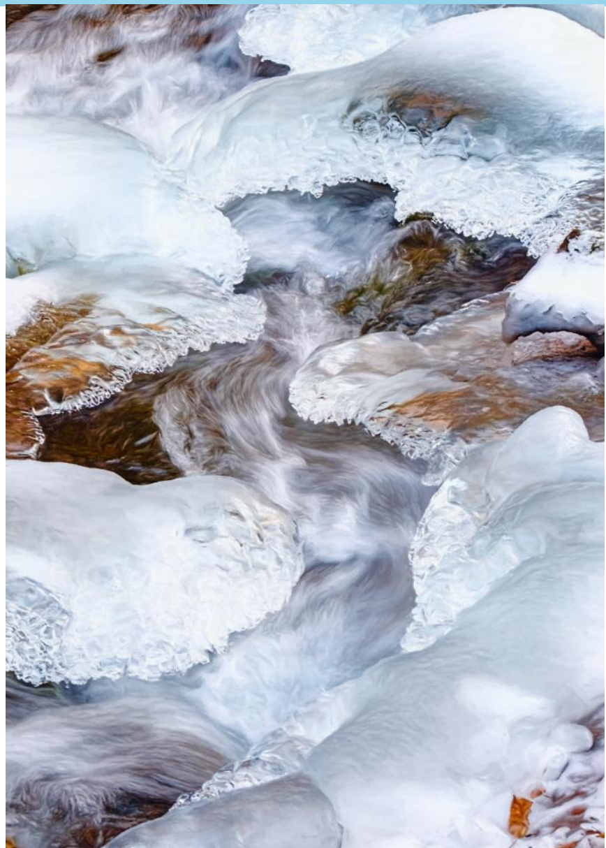
Ice over the Little Su River. Canon 60D with EF70-200f/4L at 113mm 1.3 sec at f/32