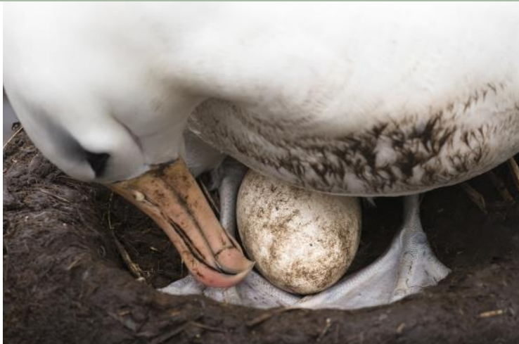
Black-browed Albatross, West Falkland Island.