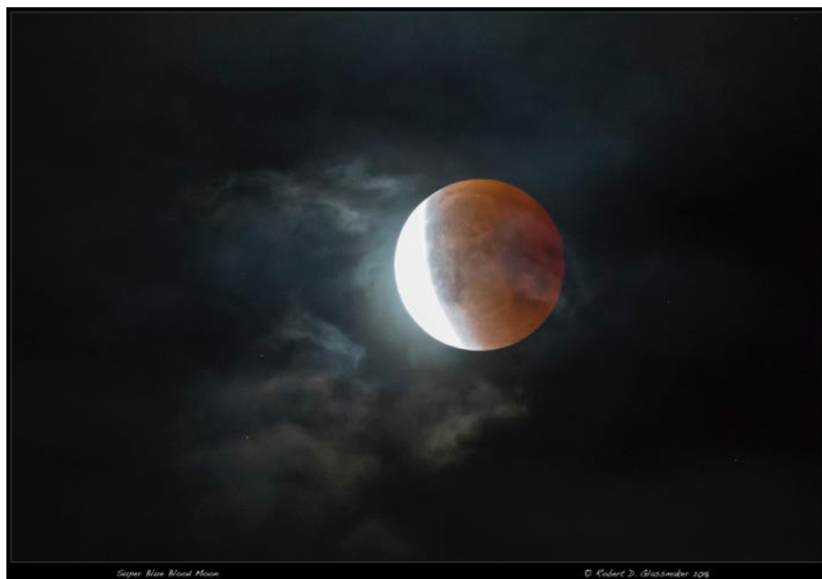
Super Blue Blood Moon, January 31, 2018