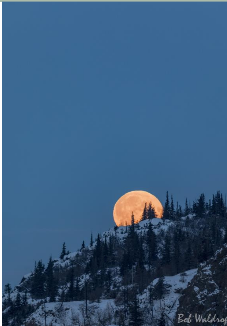
Super Blue Blood Moon, January 31, 2018