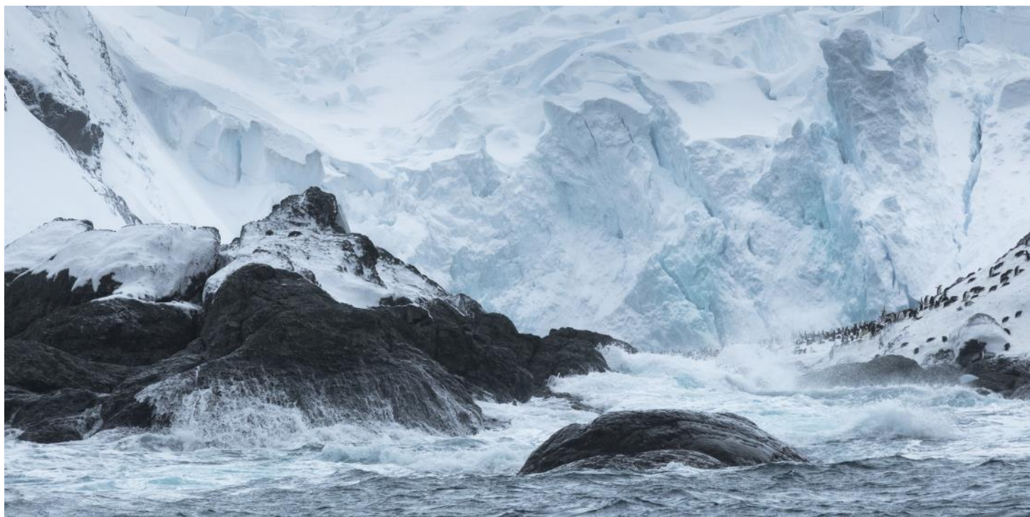
Shore break, glacier, and penguins, Elephant Island (where Shackleton's crew spent winter)