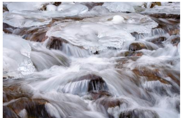
Ice caps forming on the rocks with McHugh Creek flowing undemeath them. McHugh Creek, Fujifilm X-T2 with 100- 400 lens at 103.6 1/8 at f/11 ISO 800.