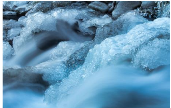
Ice and Water at Pioneer Falls Canon 60D