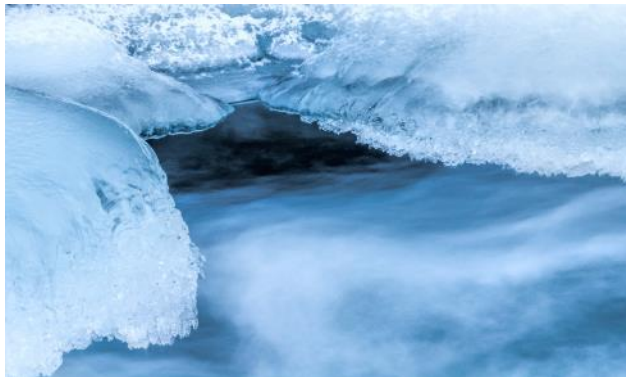
Ice over the Little Su River. Canon 60D with EF70-200f/4L at 113mm 1.3 sec at f/32