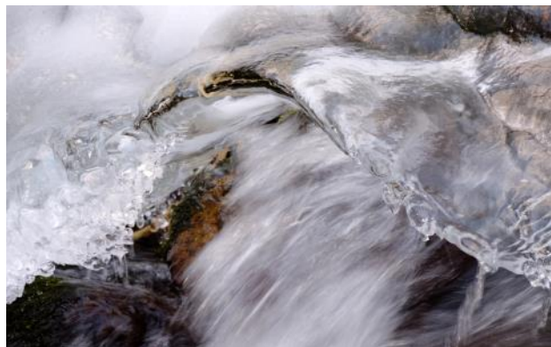
I was drawn to the curl of the ice over the water. McHugh Creek, Fujifilm X-T2 with 100-400 lens at 400 1/30 sec at f/8 ISO 800.